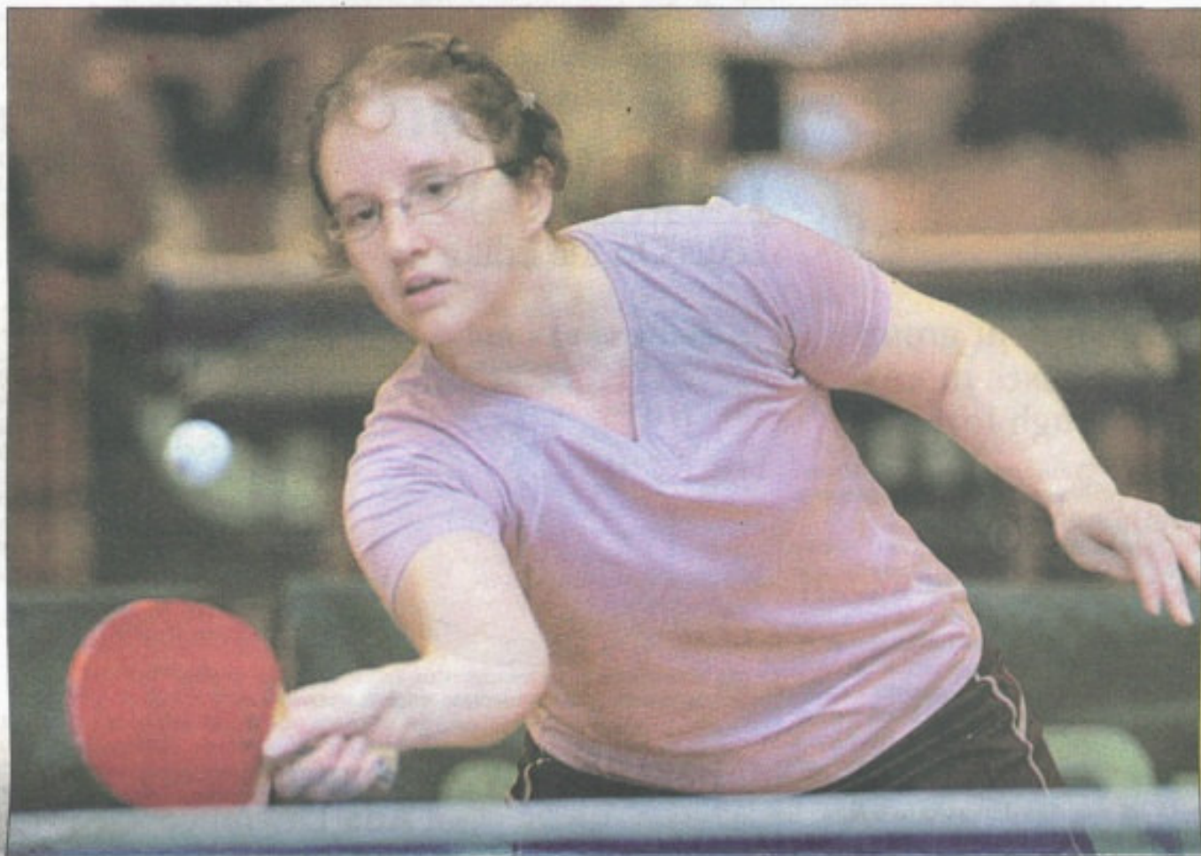
TABLE TENNIS TOURNAMENT